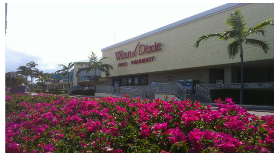
Tavernier Towne Shopping Center – Winn-Dixie's New Façade

TAVERNIER TOWNE SHOPPING CENTER: We were pleased to add Metro PCS and Lucky Duck Sweepstakes to this property during 2010 and recently in 2011, the expansion of the Landsaw Eye Care Clinic and the addition of Vitas Healthcare. We have also done a lot of work at Tavernier in 2010 and more continues in 2011. There has been a major façade remodel completed, a plan for installing a new roof on approximately half of the shopping center, and a plan to connect to the new sewer line and County operated sewer plant. These are all major, time consuming projects.