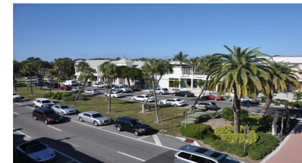
John Ringling Boulevard, St. Armands Key

We are thankful that our long term minded philosophy has provided us a far better position to approach the years of recession as an opportunity to improve. We also thank our Partners for their trust and confidence throughout the years.