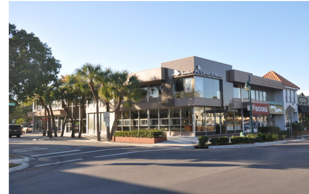
Ringling Building, St. Armands Circle

BIRD BAY PLAZA: During 2010 we welcomed Advanced Auto Parts, Little Vegas, Bird Bay Coin Laundry and Fired Up Burgers to this property. Advance Auto Parts, which is listed on the New York Stock exchange added to our list of credit tenants at the Bird Bay Plaza.