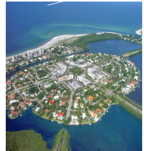
ST. ARMANDS KEY