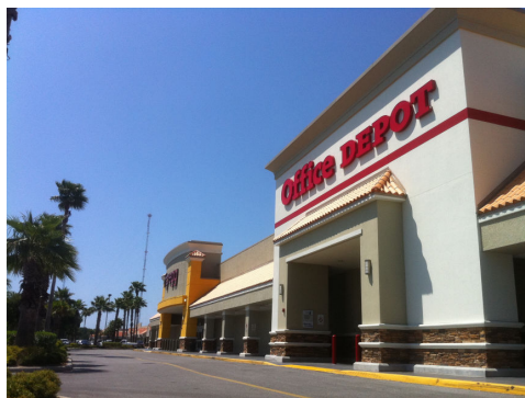
Sarasota Crossings Shopping Center - New Office Depot

SARASOTA CROSSINGS SHOPPING CENTER: The news at the Sarasota Crossings this year was the addition of the new 10,000 SF Chinese buffet restaurant in addition to a liquor store and a weight loss center. The new buffet is beautifully built out and well decorated and has been a huge success drawing thousands of customers a week to the property. Our new HH Gregg store has also enjoyed a great deal of success and is the second highest volume store opened by HH Gregg in the Tampa, MSA. We were also able to incentivize Office Depot to open their store; they had been paying rent but had never opened their store thereby conserving cash through the recession. We have given them temporary rent reduction to open and expect them to formally open the store on April 25, 2011 after completing a multi-million dollar build out. We expect the new Office Depot store to further add to the synergy of the Sarasota Crossings Shopping Center.