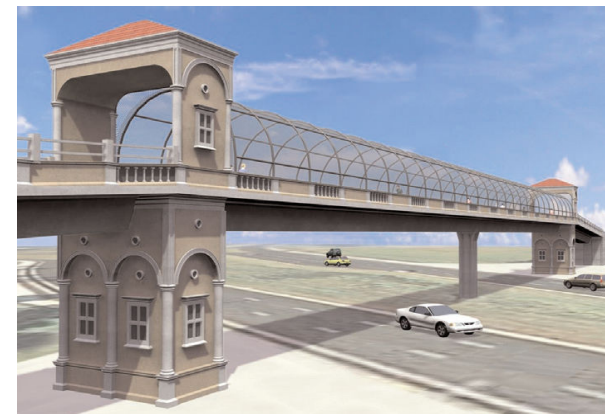
Legacy Trail Pedestrian/Bike Overpass over US 41 Bypass, Venice, FL

We also completed the replacement of the roof at the Bird Bay Plaza with a new 4-ply built up tar and gravel roofing system, built to be highly wind resistant. So far in 2011 we also replaced the LTM Party Store with a new bike store, Real Bikes, which will double the rent from what the prior tenant was paying with additional increases over the next few years. This tenant is particularly exciting to us because the County of Sarasota obtained a grant under the stimulus package from the Federal Government to build a new pedestrian/bike bridge in a Venetian style over Highway 41, serving the bicycle trail adjoining the Bird Bay Plaza. This biking trail will highly likely become a destination biking area, not only for locals but for visitors as well. Real Bikes will service this recreational population well.