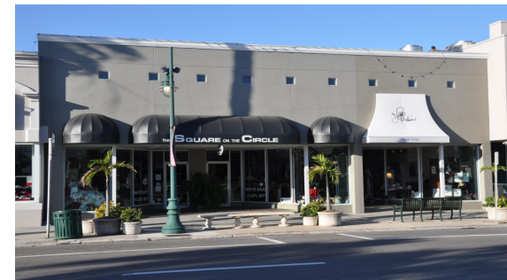
Presidents Building, St. Armands Circle

ST. ARMANDS CIRCLE: St. Armands Key is an exclusive barrier island on the Gulf of Mexico between the Sarasota mainland and Long Boat Key and Lido Key. In the center of St. Armands Key the St. Armands Circle shopping district provides a home for more than 100 individual businesses in a park-like setting, providing a pedestrian friendly shopping district, much like Miracle Mile in Coral Gables or Lincoln Road on Miami Beach. This upscale shopping district with both shops and restaurants is the center for commercial activity serving the tourist areas of Sarasota County as well as providing fine dining and entertainment for the local population. Our acquisition of two buildings totaling just under 20,000 SF was completed on December 31, 2010. We see a great deal of opportunity in these properties and have already changed out one tenant through assignment of the lease which will result in increased rents and have dealt with a number of new possible retail tenants including public companies for space in these buildings. Needless to say we are encouraged by our first few months of ownership and expect these blue chip properties to produce a solid rate of return with steady increases in income over the next years. Many of the existing tenants are also quite prominent in the community, including McCarver & Moser, a jeweler and Square on the Circle, a home décor store, both of whom have been tenants in these properties for decades.